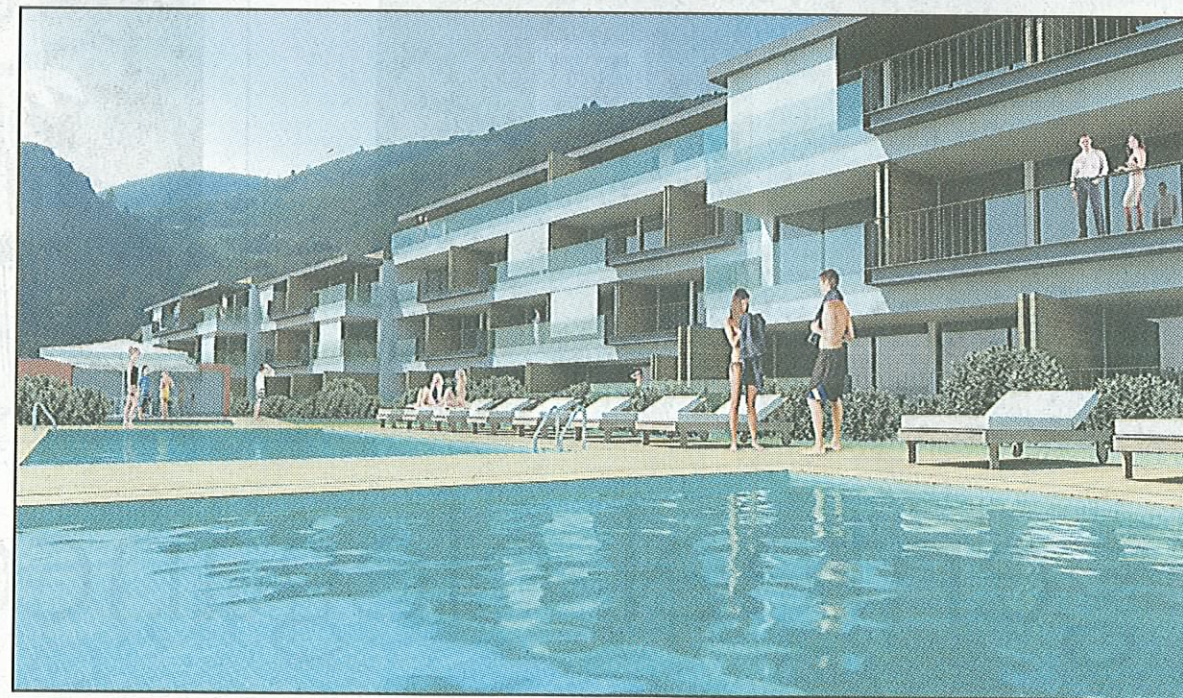
Sesimbra Bay Beach and Spa Resort consists of 204 fully finished luxury apartments.

This resort will consist of 204 fully furnished luxury apartments situated in three blocks of three levels, each with private adult and