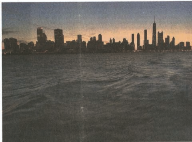
An S Class Mercedes (right) or a studio apartment (left) with a 7pc yield in Chicago's financial district for less money? Choices, choices

Would you just look at Century Tower in the picture on the left. Nice I think you'll agree and slightly more pleasing than Liberty