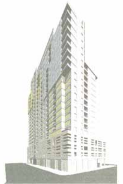
The Catalyst (above) at West Washington project is located at the gateway to Chicago's dynamic Loop and in the heart of its transportation core